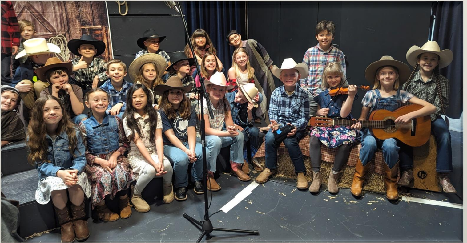
Advanced Choir performing "Praise"