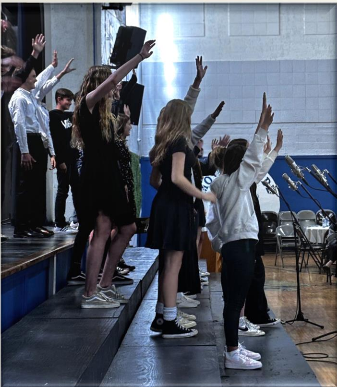
Advanced Choir performing "Praise"